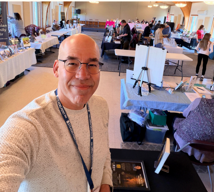
DePere, WI: Author's Among Us Book Fair 2026

More events and appearances will be posted soon on the new Homemade Author website. ☀