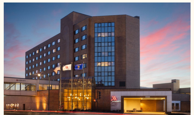
Lakefly Writers Conference 2027 will be held on May 7th and 8th at the Oshkosh Convention Center