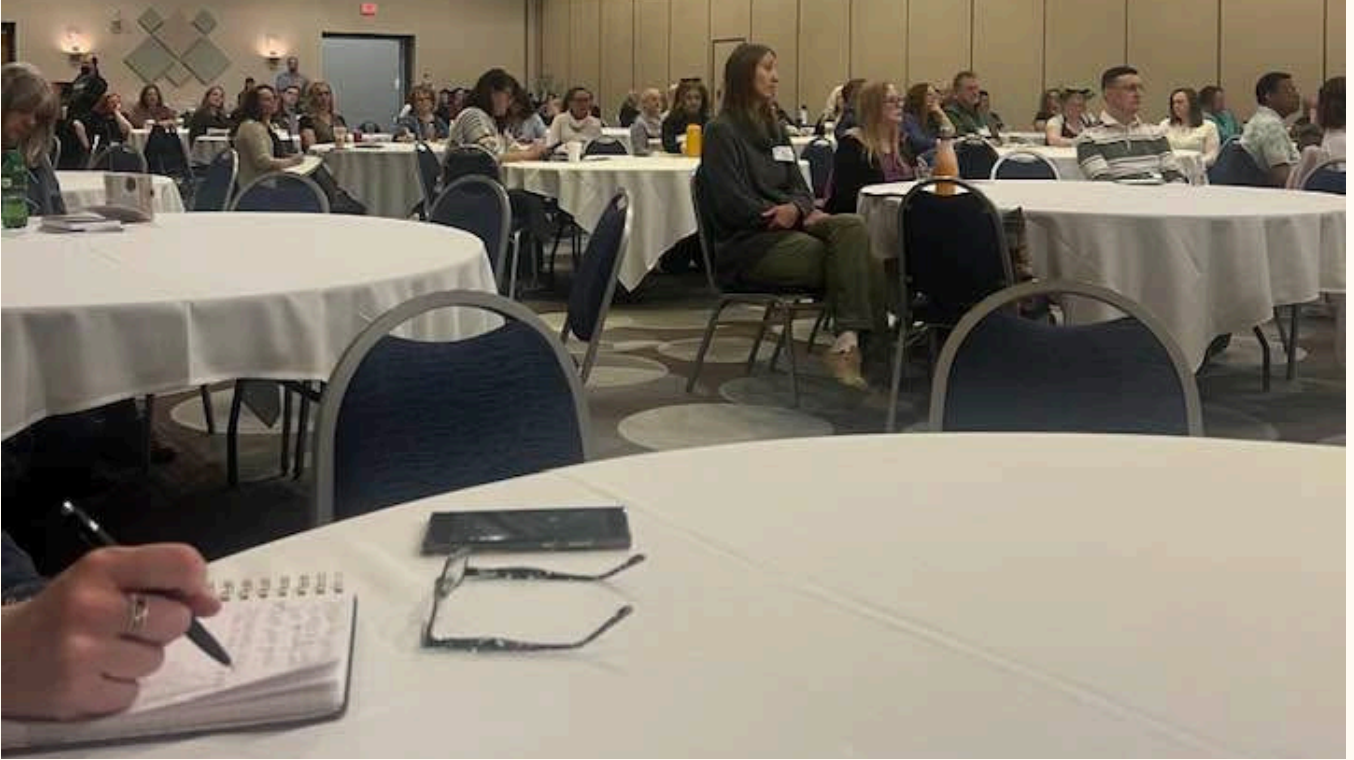
Lakefly Writers Conference Keynote 2026 The Universal Truth to Shaping Your Writing Life