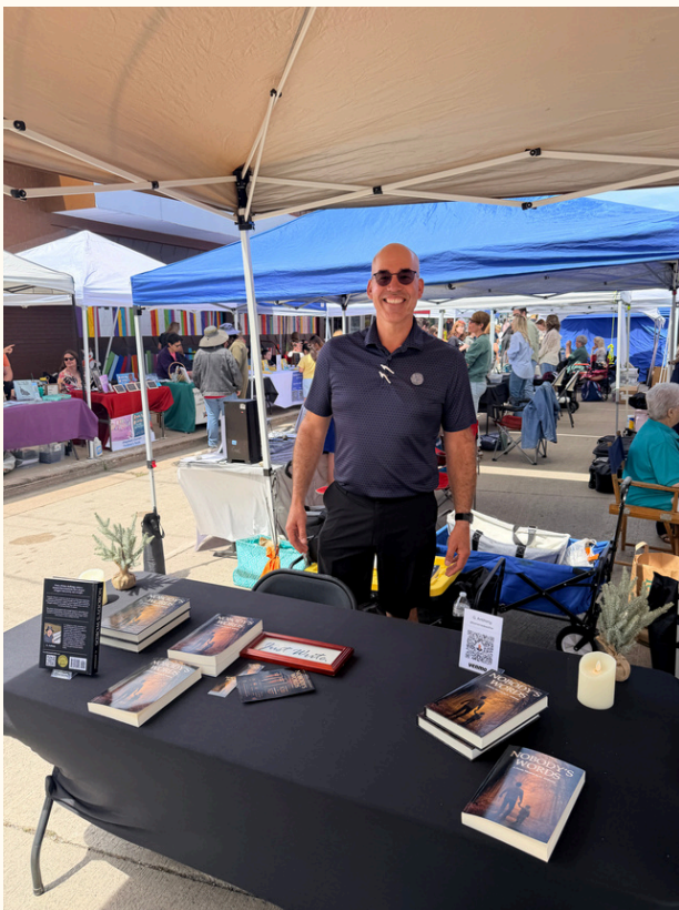
Appleton, WI: Block of Books Book Fair 2026